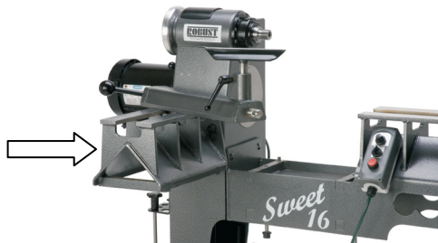
Above: Remove the gap bed and re-position it on the headstock to convert the Sweet 16 into a 32" bowl lathe.