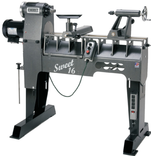
Above: Standard bed Sweet 16 as a normal 16" x 26" lathe.

Converts to any of these three configurations in under a minute!